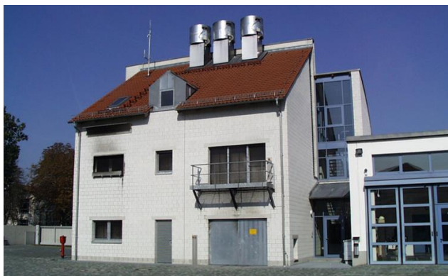
Figure 3. Fire training building (cf. http://www.sfs-w.de )

The experimental scenario was developed in a roundtable session with instructors of the firefighting academy in late 2017. A squad of firefighters will respond to a simulated apartment fire on the second floor of a multi-level building. The building will be represented by the fire training building of the academy (cf. Figure 3). The building emulates a typical residential building with multiple apartments. With remotely controlled gas-fires and fog machines simulating smoke inside the building, the scenario will be designed like a real-world apartment fire. As the task, we selected the search and rescue of a missing person (represented by a dummy) from the apartment. For our experiment, the responding squads will consist of one squad leader and a team of two firefighters. The squad leader commands the task. (S)he will first explore the incident site and then brief the team. The team will be ordered to enter the building, search, and rescue the dummy from a certain room inside the building. Other members that are part of a real-world squad (e.g. the operator of the fire engine) will not be considered in the experiment, which constitutes the virtually only unrealistic element of our experiment.