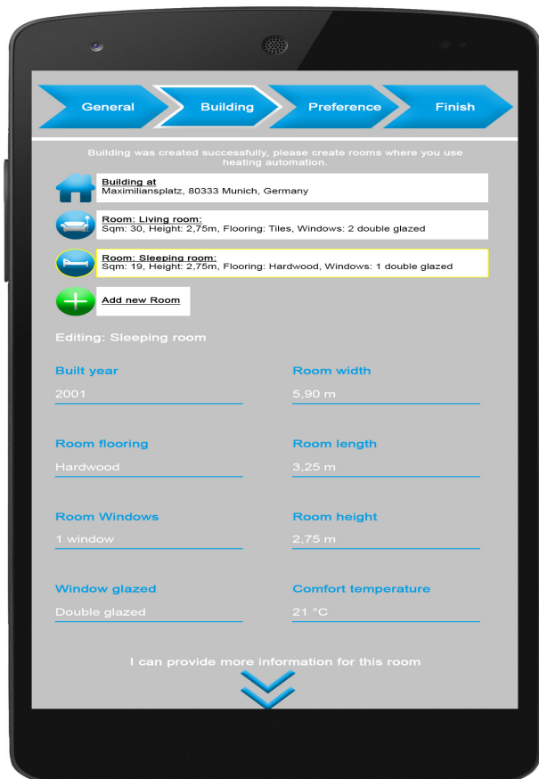
Figure 3: RIA user Interface

Since typical users are not experts, required physical data such as heating coefficients can't be gathered immediately. In fact, for ease of use a RIA has been developed as guided application for setting-up the SHHC. Users have to enter building- (e.g. year of construction or modernisation, roof type) and room-specific data (e.g. height, comfort temperature) as well as preferences like comfort temperature. Figure 3 shows the RIA running on a mobile device. Initial building data, which is not immediately appropriate as physical building parameters for the MPC, but sufficient for a similarity measurement, is transferred to the database of the OOT. Required parameters such as the efficacy of certain heating controls under certain user requirements and conditions can be determined by measuring actual states of the systems and learning to functionally interpret the deviations to the planned states. Thus, an effortful technical analysis of each building becomes obsolete. Identified functional relations can be transferred to similar buildings, for which the SHHC has to be set up.