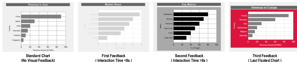
Figure 2: Types of visual feedback

interruption. The second type is issued to charts that the user interacted for more than eight seconds. This means the user scanned the chart long enough to notice the content of a chart. The third type of visual feedback is shown on the chart that was fixated last by the user before the interruption. We did not consider any time limitation for this type since the purpose is to guide the attention of the user to the last point before interruption. For this type of feedback, the red color is used as a pre-attentive method (Treisman & Gelade 1980) to draw the attention of the users to the last point before the interruption.